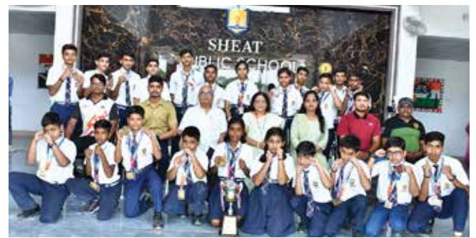
WAKO INDIA NATIONAL KICKBOXING CHAMPIONSHIP 2022!

Students of SHEAT Public School won 2 Gold & 2 silver medals in the