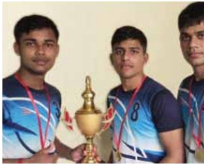
WINNERS IN 46TH STATE LEVEL CHAMPIONSHIP!

REPRESENTED VARANASI DISTRICT FOR STATE LEVEL KABADDI CHAMPIONSHIP.